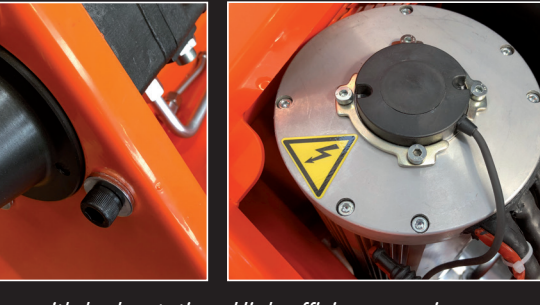
Power setting from 10% to 100% 4 hydraulic engines with hydrostatic High efficiency engine braking system