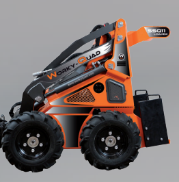
Engine capacity 11,7 Hp